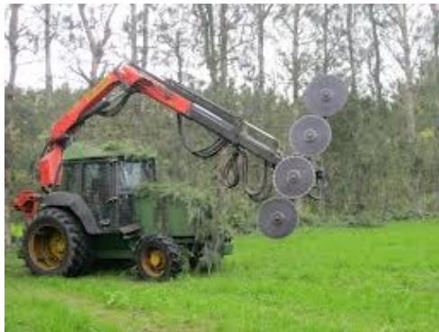
Figure 3: Heavy orchard machinery

Some of these symptoms, particularly stunting of new growth, and less vigorous growth of shoots and canes, can also be associated with poor graft take. It can be difficult to distinguish between effects in the early stages after grafting. An inherent difficulty also exists in distinguishing between budwood infection, and infection occurring from inadequate hygiene during grafting, via tools. Insufficiently protected new grafts, would also be susceptible to infection, particularly when weather events wash off waxes and pruning paints. Again making it difficult to distinguish between latent infection in plant material and infection via large grafting wounds and exposure to aerosol Psa-V .