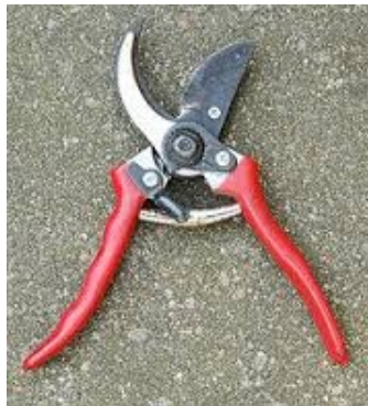
Figure 2: Pruning tools