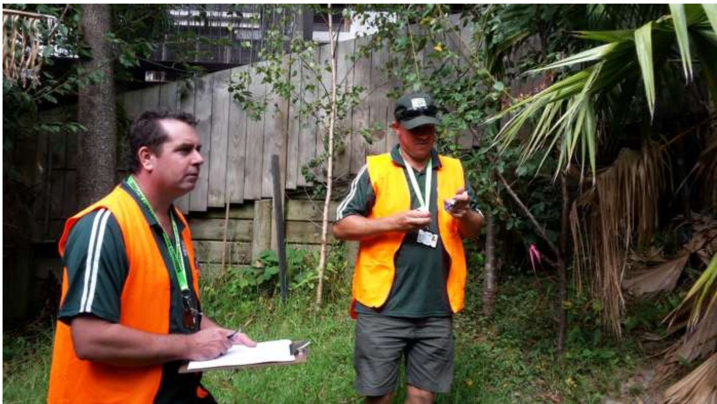
Surveillance teams logging and tagging host plants