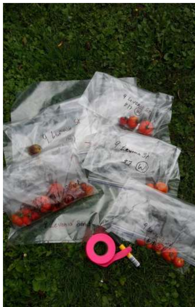
Rotten, windfall & shaken fruit, collected & bagged