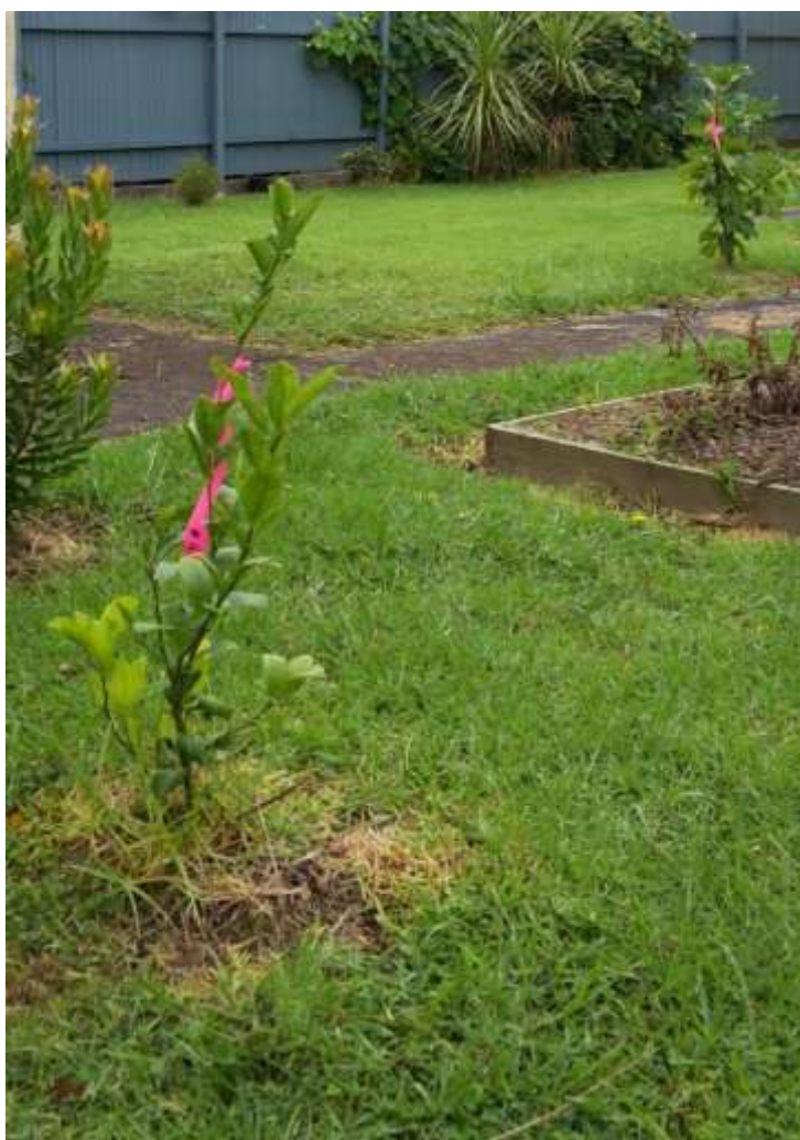
Tagged host plants