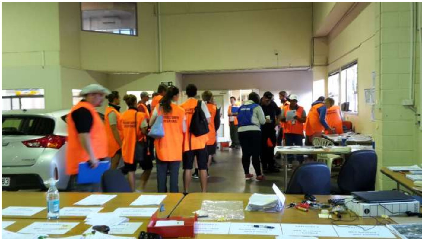
Survey teams at HQ