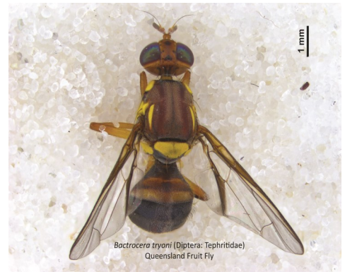
Images above from left to right: side view of the QFF; larvae in a mango; top view of the QFF