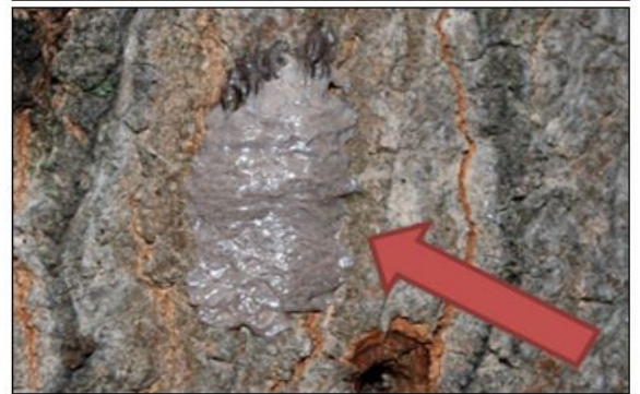
Figure 1. Spotted Lanternfly adult (top) and egg mass (below).