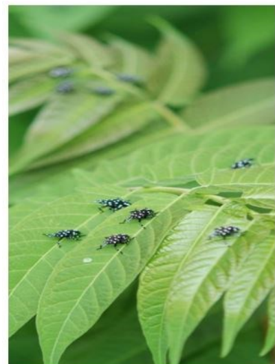
Figure 3. Spotted Lanternfly nymphs on Tree of Heaven.

SLF has the potential to severely impact the kiwifruit industry through the accumulation of sooty mould on fruit from feeding excretions, ultimately rendering the fruit unmarketable. The pest also aggregates and may create a nuisance in urban areas.