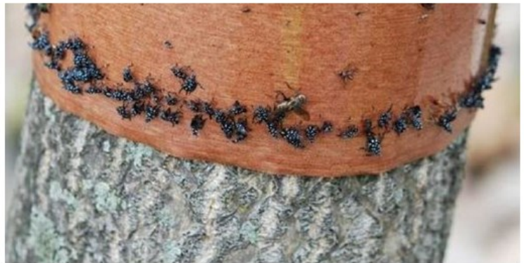
Figure 5. Banding with sticky paper can stop SLF nymphs.

In the image to the right, a tree has been banded with sticky taper (or tape can be used) to stop SLF nymphs crawling up the tree to find a place to feed.