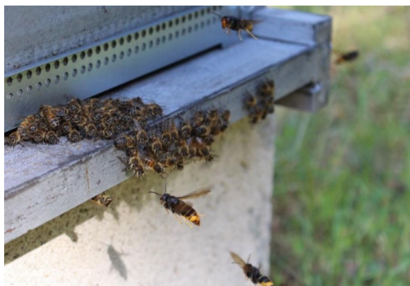
Photo: Hunting behaviour of the Yellow-legged hornet, showing the size difference between hornets and honeybees.

Honeybees are already facing numerous threats in New Zealand without the risk of further impacts from pests such as the Yellow-legged hornet. Furthermore, by nesting in urban areas, the Yellow-legged hornet (which is well known for its aggressive behavior), is a potential threat to human activities also.