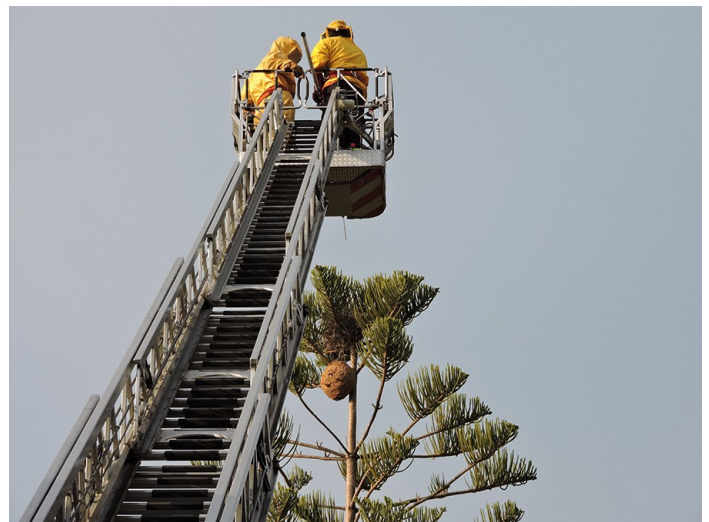
Photo: Often nesting in the top of tree canopies, nest destruction can be difficult.

Nest destruction is the most commonly used technique, and the most expensive. It must be undertaken at night when all hornets have returned to the nest, otherwise in the day, returning hornets will simply set up a new nest.