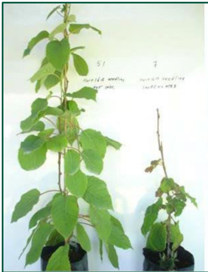
An infected plant (on the right) is compared to a healthy plant (left) to illustrate the stunting of growth, dieback and discoloration on the leaves.