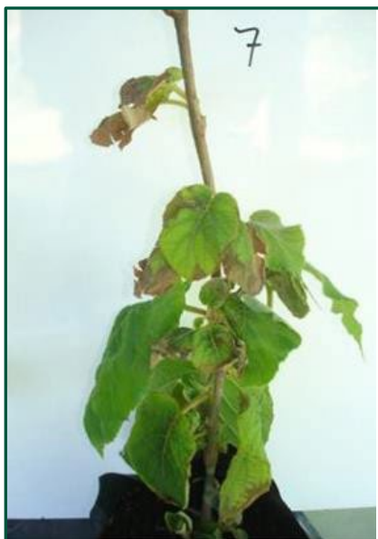
Discoloration and wilting of leaves