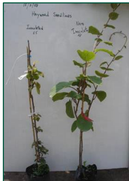
Comparison of infected plant (left) to a health plant on the right, showing the loss of vigour and stunted growth