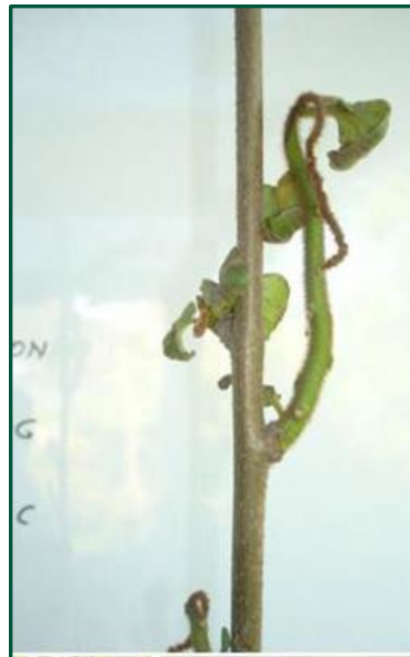
A new shoot that is showing discoloration, wilt and dieback