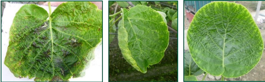
Figure 1. Kiwifruit leaves from China displaying symptoms typical of viral infection (however the cause of the symptoms above is unknown).