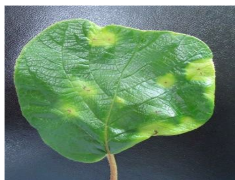
Symptoms of Psa Biovar1 on Hayward in Japan

Therefore, nurseries should be very familiar with Psa symptoms and report plant symptoms resembling these, or any plant symptoms where the cause is unknown.