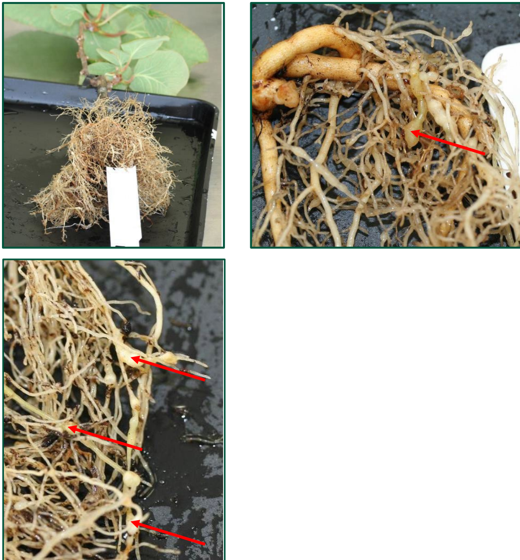
Figure 4. Early infection of kiwifruit seedlings by root knot nematodes.

The first sign of infection is galling on the roots (indicated with red arrows below). Root galls are large knots or the appearance of swelling.