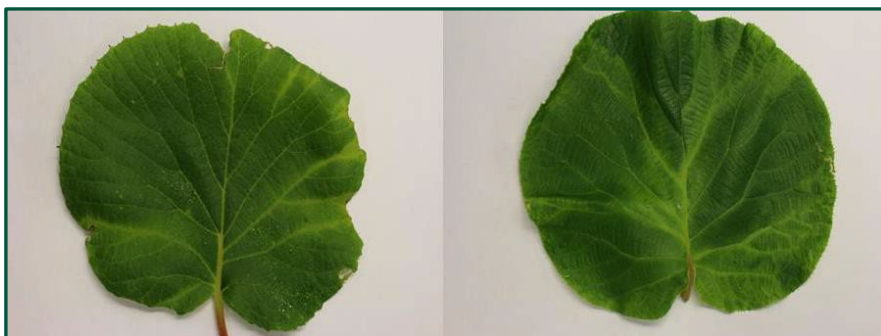
Figure 2. Cherry leaf roll virus-infected Gold3 plants exhibit vein chlorosis (left) and leaf curl (right).