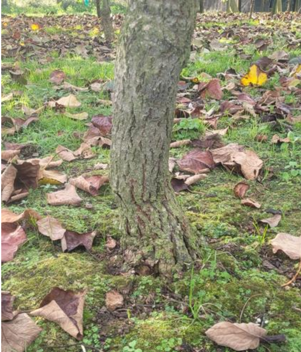
Cracking at base of low vigour vine