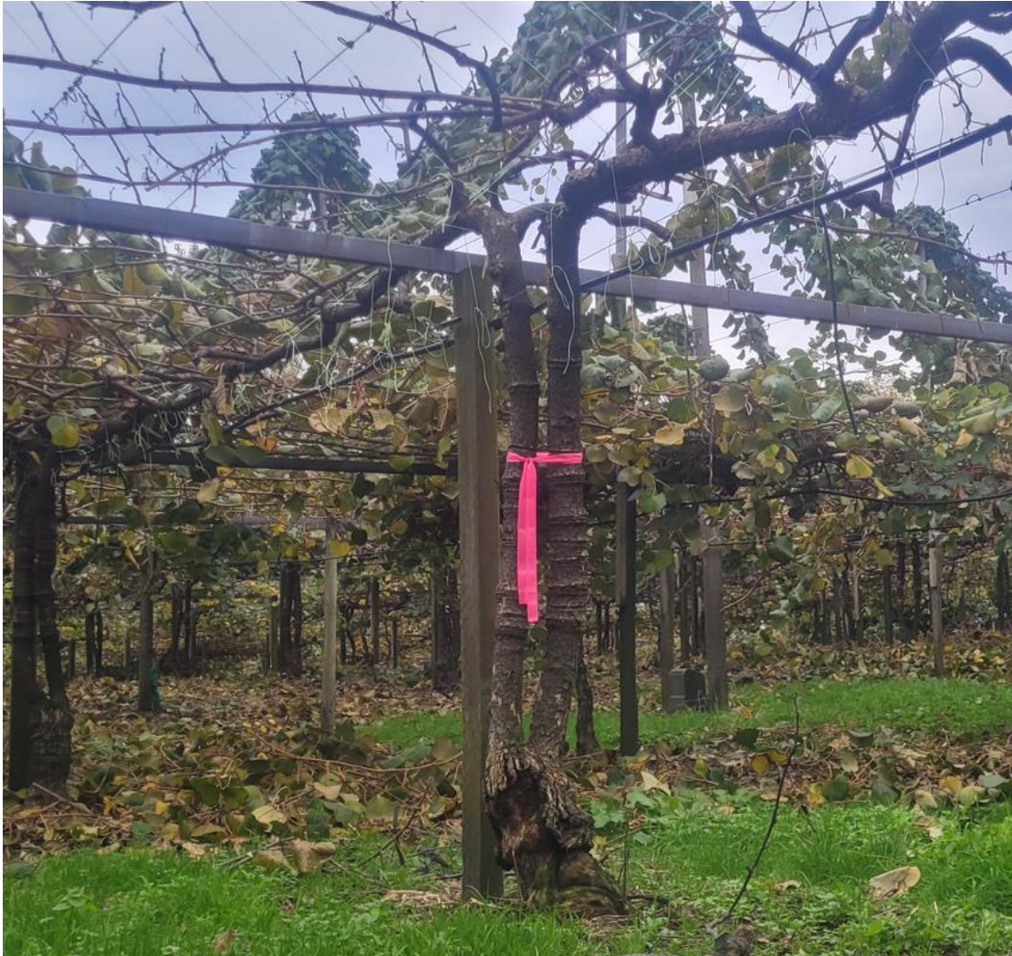
Vine collapse mid season