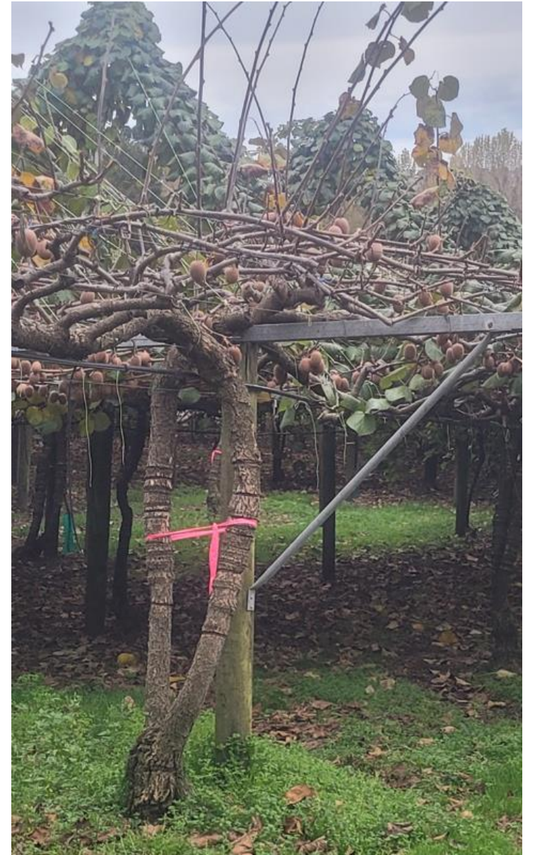
Images from left to right: Swollen and uniformly enlarged Hayward trunk; Staining / internal discolouration of wood from infected vines; Staining / internal discolouration of wood from infected vines