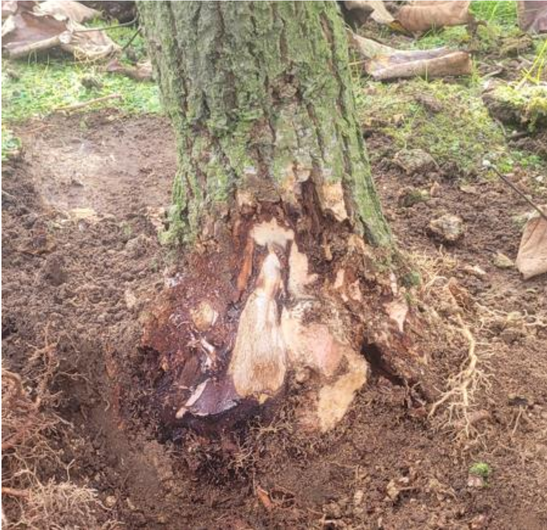
Underlying root and trunk base infection