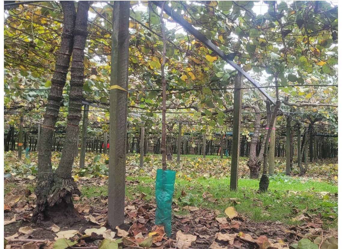
Replant alongside symptomatic vine