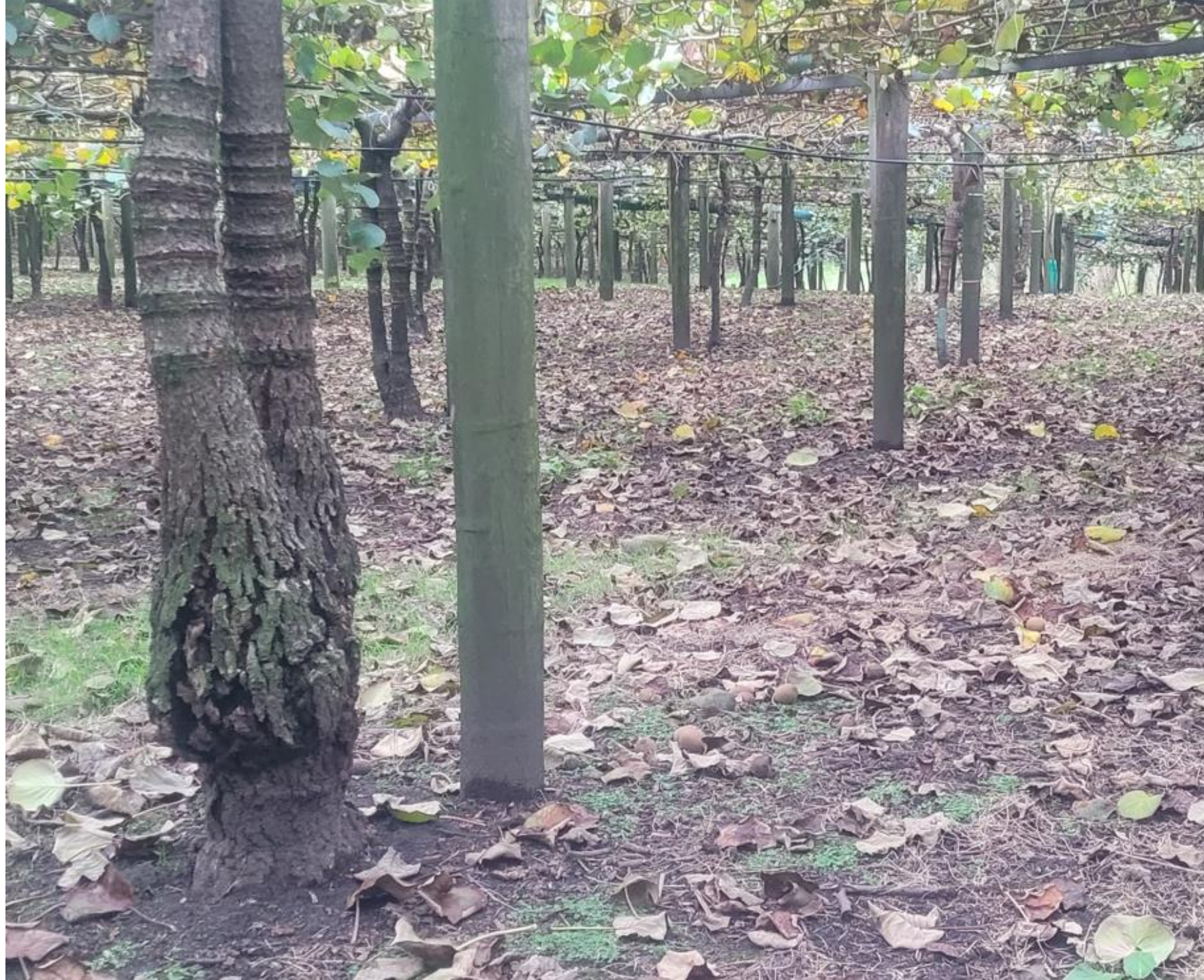
Swelling and cracking above the graft