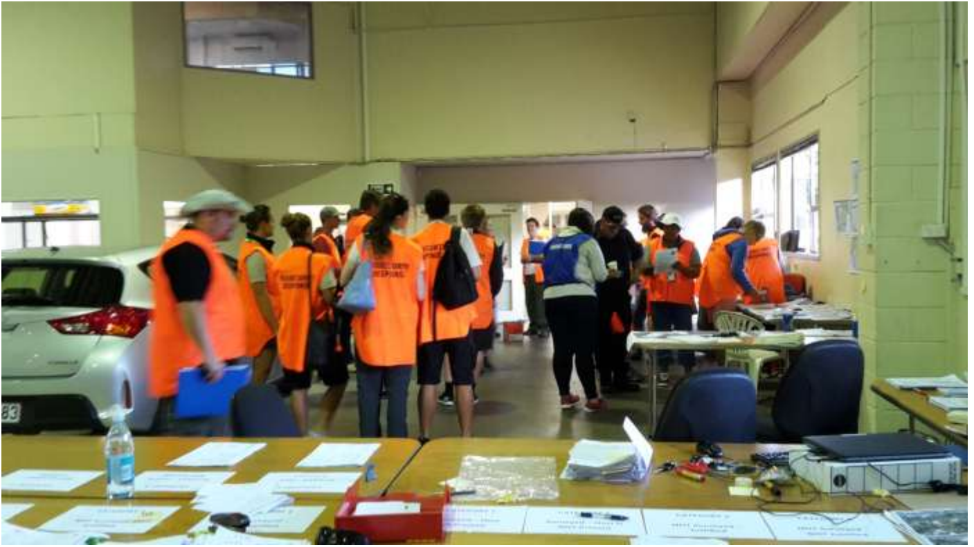
Survey teams at HQ