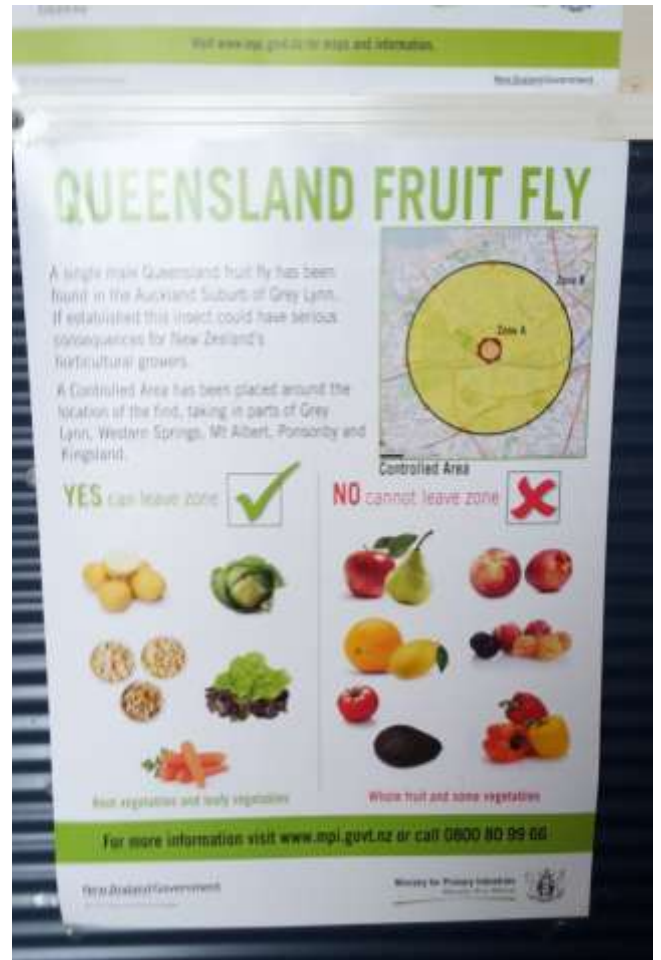
Fruit fly signage