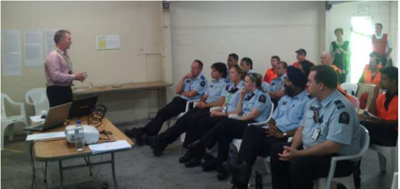
Staff briefing at response HQ, prior to Cricket World Cup match