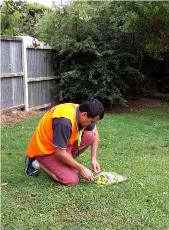
Collecting windfall fruit