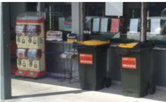
Fruit collection bins outside fruit & veg shop