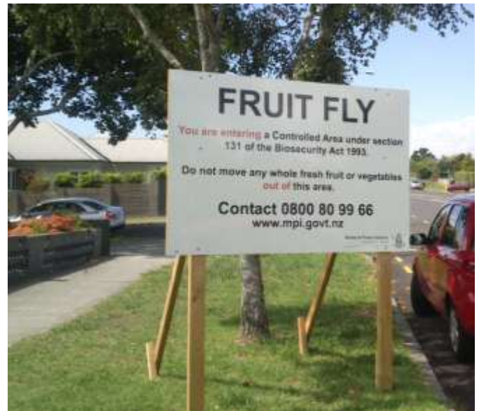
Fruit fly signage in Zone B and at Zone B boundary