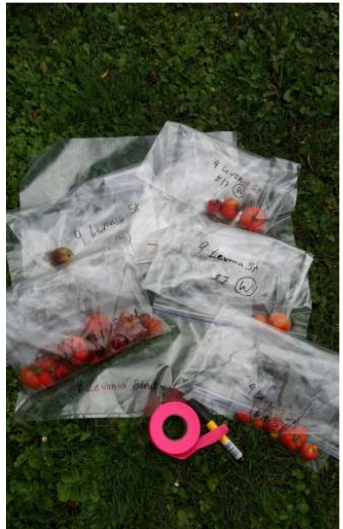
Rotten, windfall & shaken fruit, collected & bagged