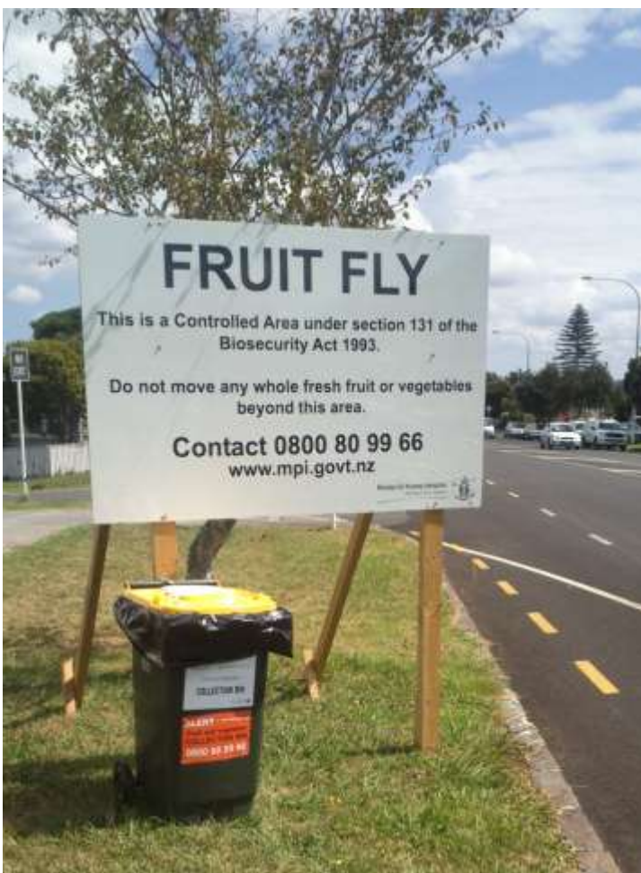
Fruit fly signage at Zone B boundary