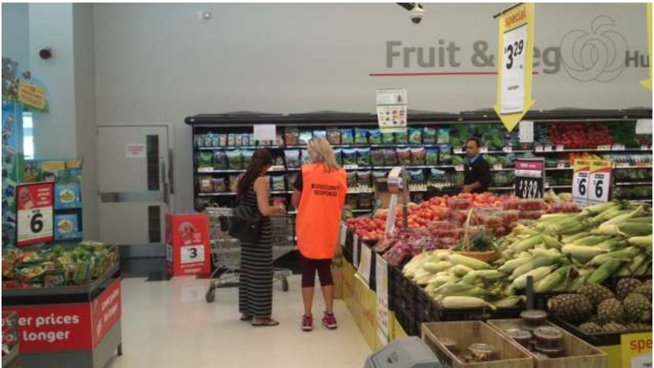
An Auckland Council civil defence volunteer speaks with public to gauge awareness at Grey Lynn supermarket