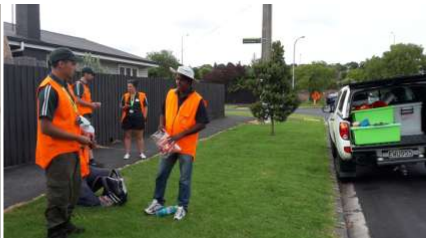
Surveillance team on the ground