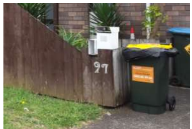
Fruit collection bin within Zone A