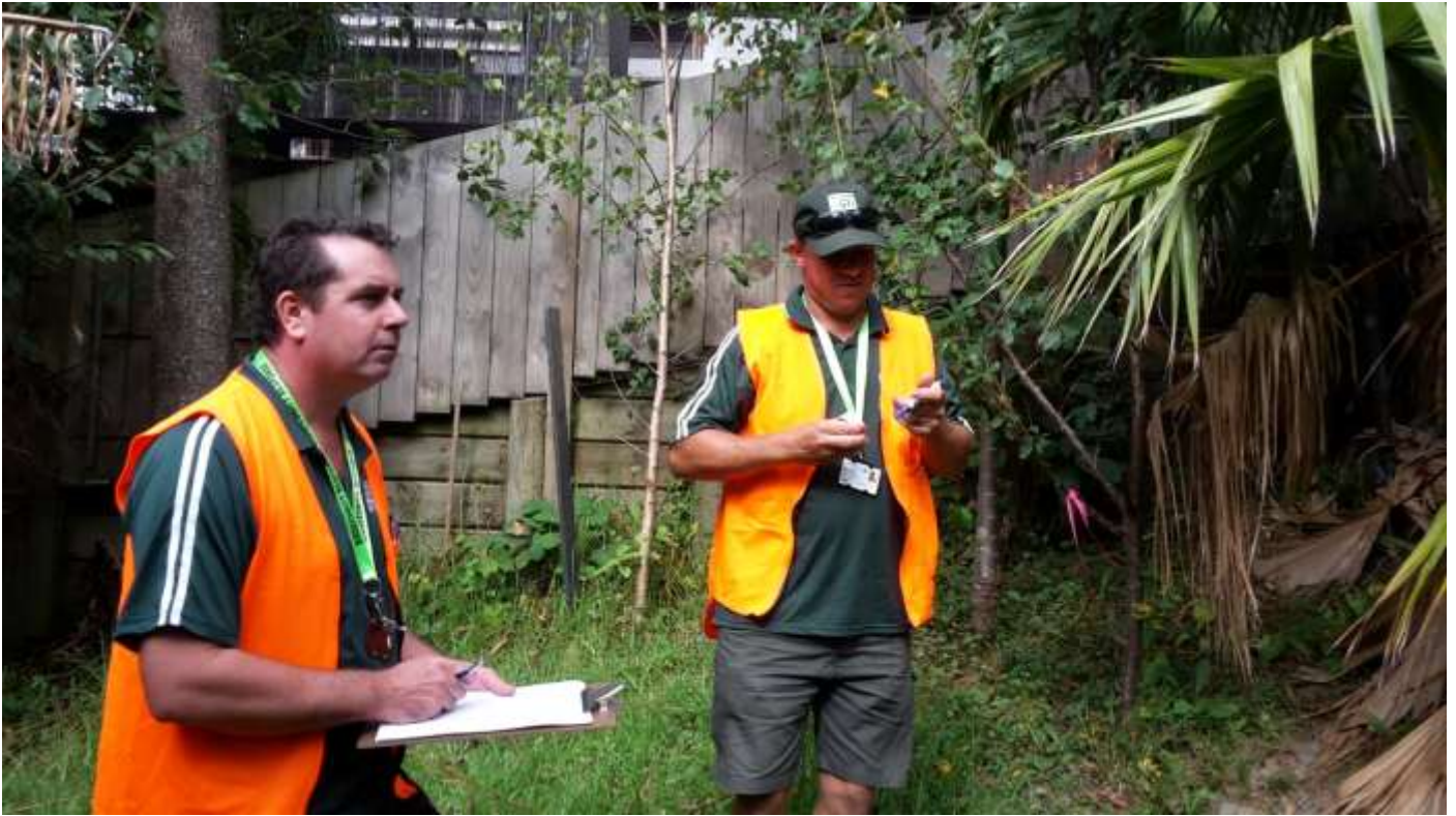
Surveillance teams logging and tagging host plants