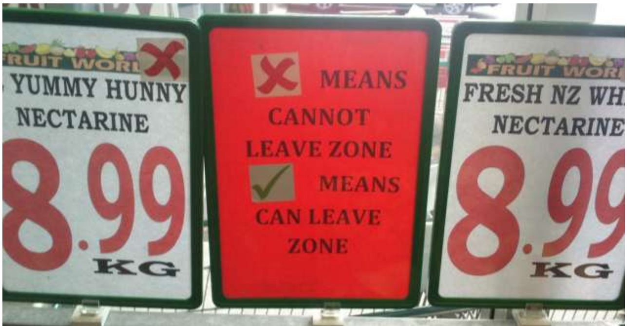
Signage explaining 'tick and cross' movement control system at fruit & veg shop