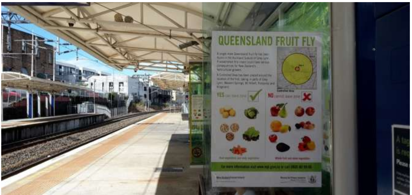
Fruit fly signage at train station, Eden Park