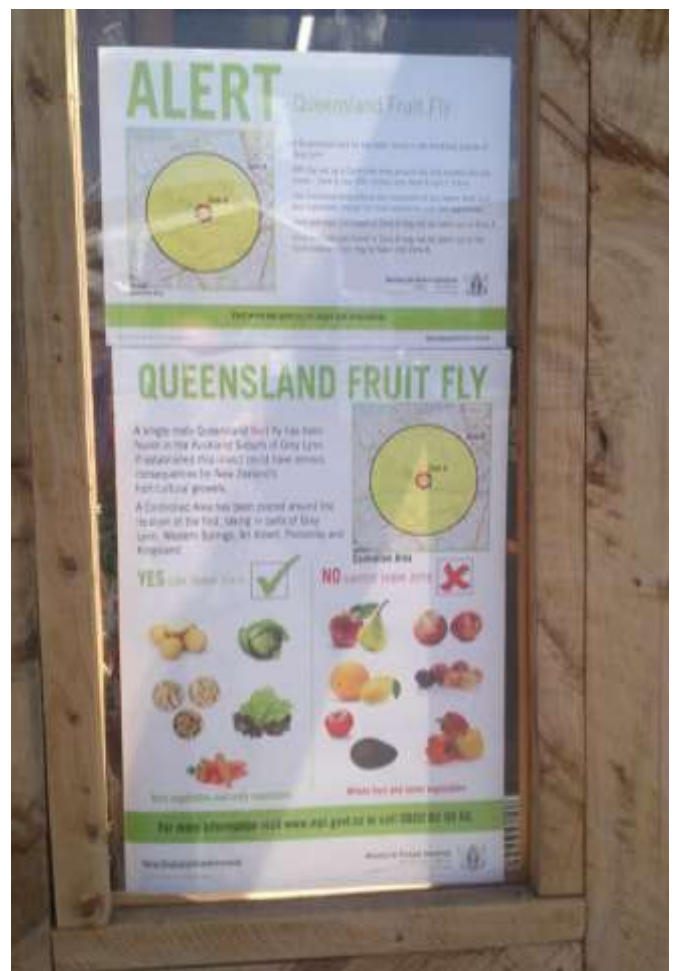
Fruit fly signage at entrance to fruit & veg shop