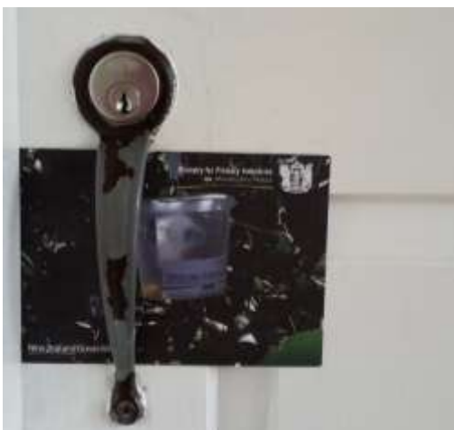
MPI calling card