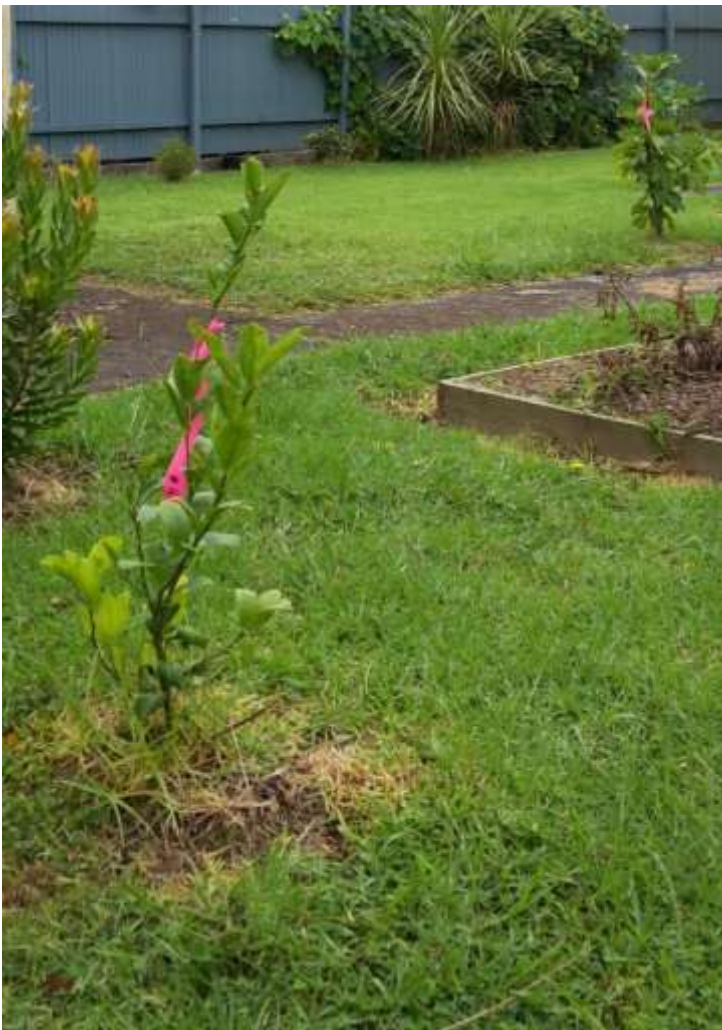
Tagged host plants