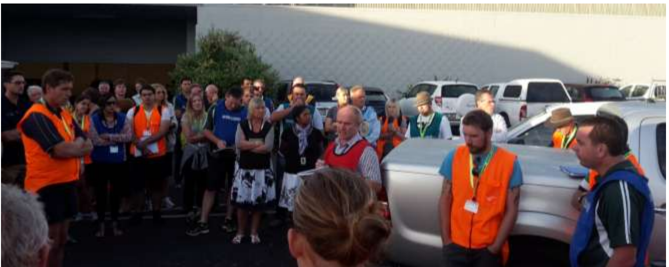
Morning operations briefing