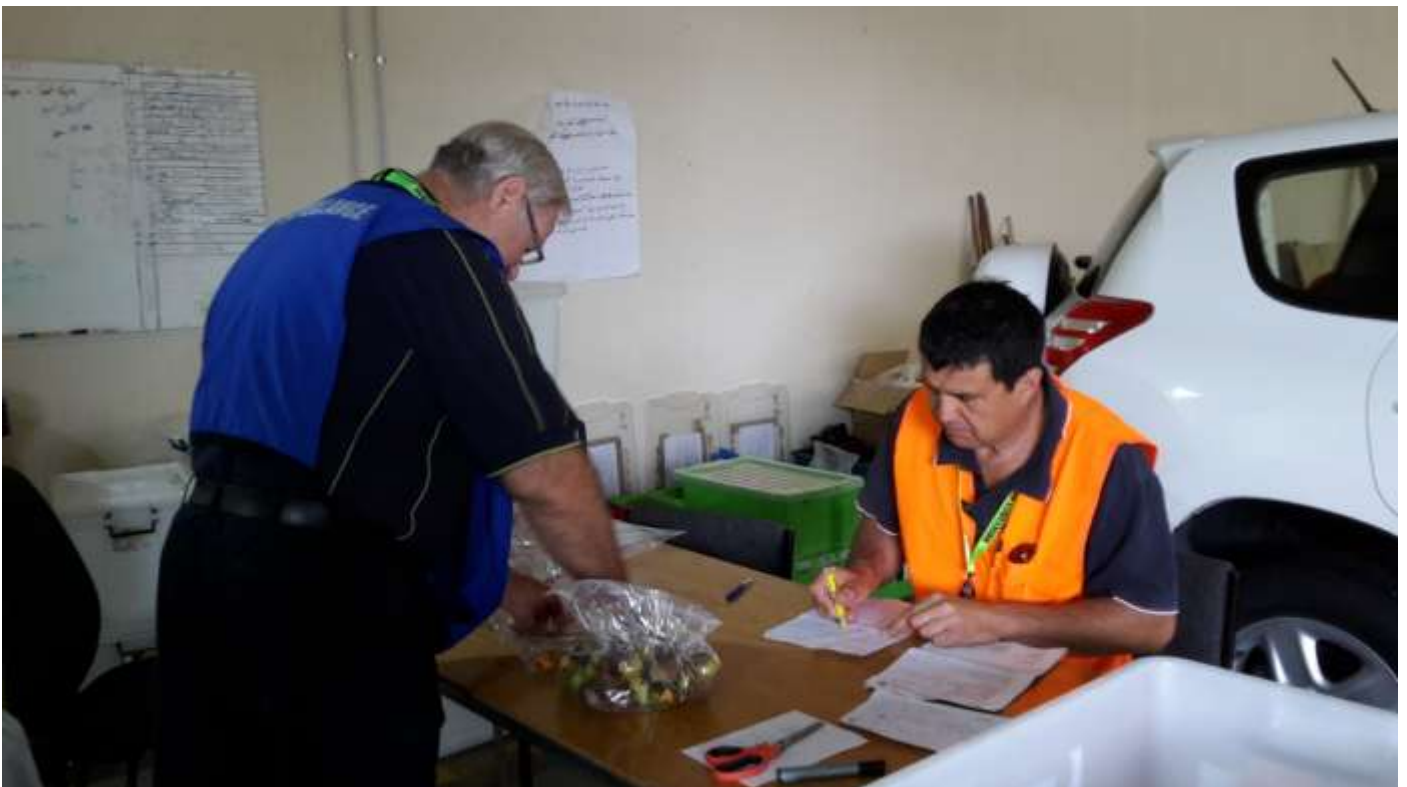
Checking collected fruit