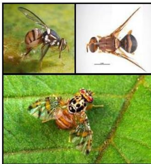
Figure 1. Adult specimens of fruit fly; Oriental Fruit Fly (top left), Queensland Fruit Fly (top right) and Mediterranean Fruit Fly (bottom).

Horticulture Innovation Australia estimates the annual cost of control measures, lost exports and contaminated produce related to the QFF is at least A$150m. Should a breeding population establish in Te Puke economic impacts are estimated to be $100-$400 million.