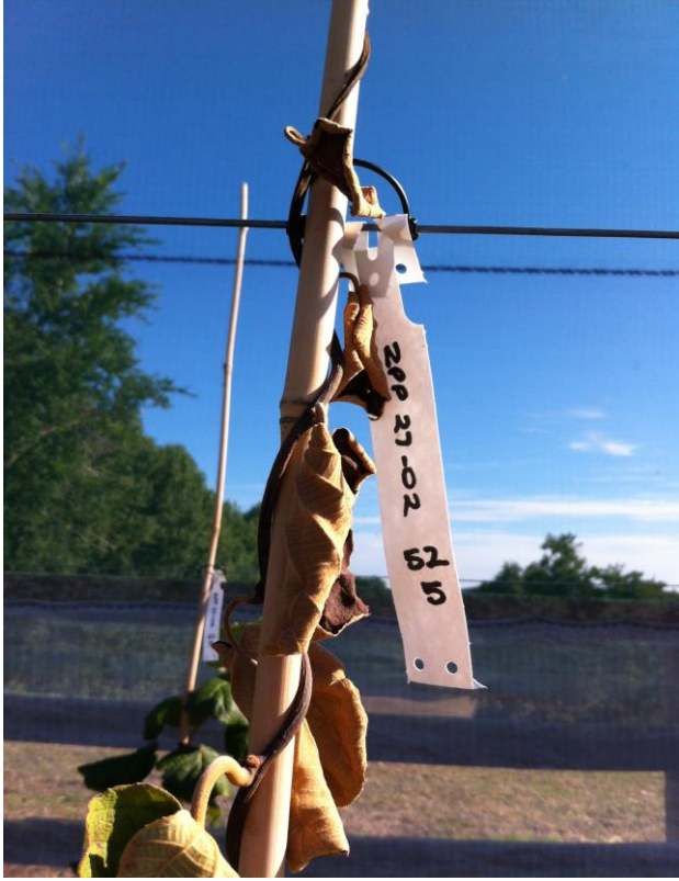
Figure 3. Image of a plant showing shoot die back, secondary symptom score of '3'.