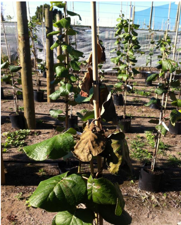
Figure 4. Image showing a plant inoculated with Psa.