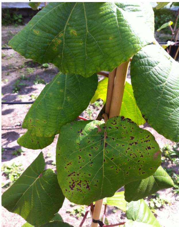
Figure 2. Image of a plant showing leaf spotting and halos.

Figures 2 and 3 are representative images of symptoms assessed throughout the trial; leaf spotting and secondary symptoms. Figures 4 and 5 show the comparison of a Psa inoculated plant and water treated plant at the end of the trial.