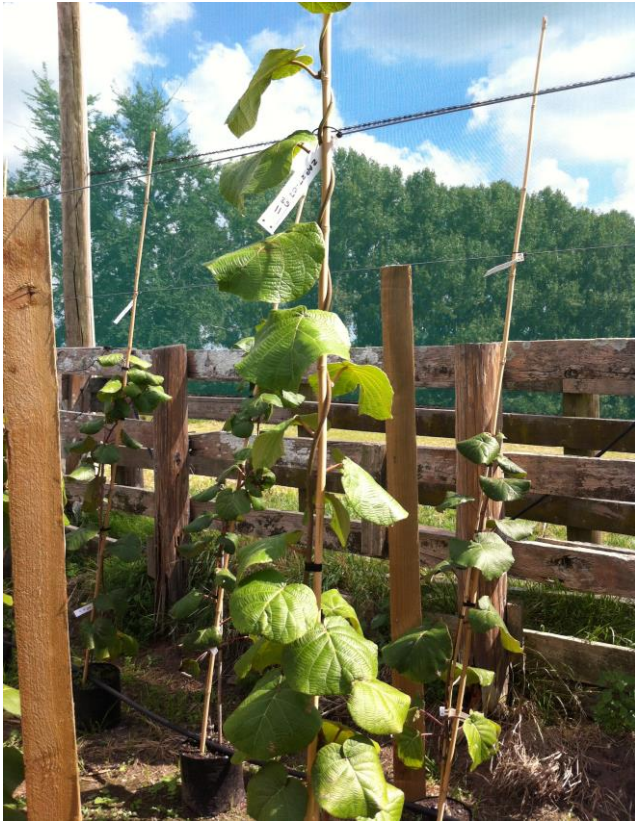
Figure 5. Image of a plant treated with water only.