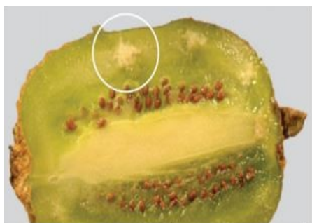
Figure 2. BMSB feeding damage to Hayward kiwifruit from a laboratory trial (UCR, CA)

BMSB has a very wide host range of over 200 plants, including kiwifruit. BMSB adults and nymphs suck on the sap of leaders, young leaves, shoots and fruit. Injured fruit typically has black spots or blue scars on the skin, flower or fruit drop and deformed fruit. The injured parts of fruit usually turn white and “spongy” and eventually rots (figure 2).