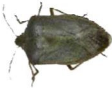
Brown form of green vegetable bug ( Nezara viridula ) Approx. 17mm long Present in New Zealand