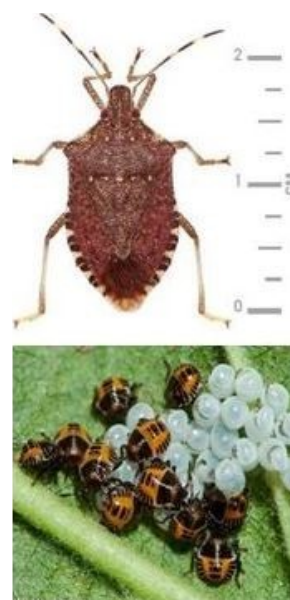
Figure 1. Adult BMSB with ruler to indicate large size (top), nymph and egg mass (bottom).

Eggs are plain white or pale green and cylindrical shaped, laid on the undersides of leaves in clusters of about 25. The eggs are only 1mm in diameter but become apparent when nymphs emerge as they stay with the egg mass for several days.