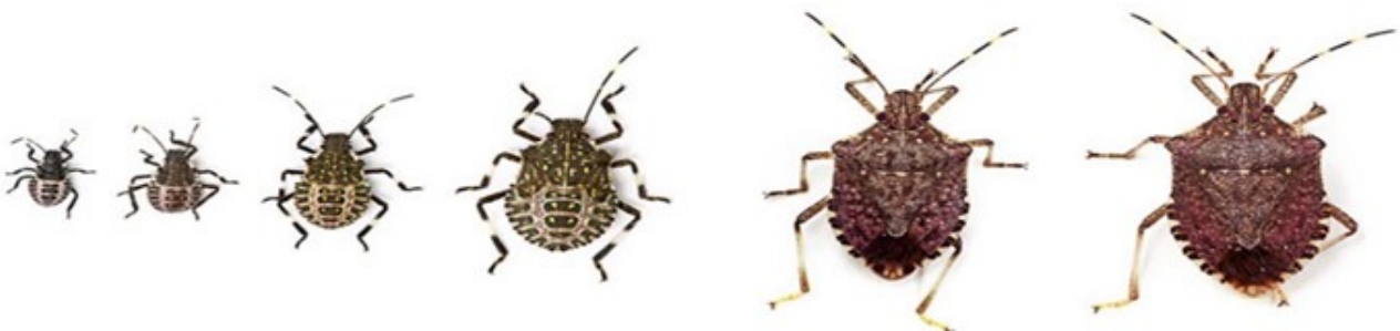
Figure 4. Nymphal stages of BMSB. 2nd to 5th instar, adult male and adult female.