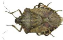
Brown Marmorated Stink Bug ( Halyomorpha halys ) Approx. 17mm long Not present in New Zealand