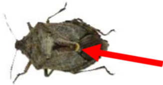
Brown soldier bug ( Cermatulus nasalis ) Approx. 15mm long Present in New Zealand and identifiable by a yellow crescent moon on its back