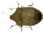
Brown shield bug ( Dictyotus caenosus ) Approx. 10mm long Present in New Zealand