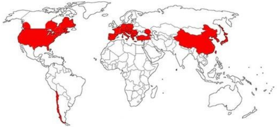
Figure 3. Distribution of BMSB (in red)

BMSB is now present across three major continents (figure 3). It is native to Asia and found in China, Japan and Korea. In 1996 it invaded the USA where it has been found in 44 states and four Canadian provinces. In 2007, it was detected in Switzerland and 13 countries across Europe are now reported to have established populations, with a further eight countries reporting interceptions. BMSB is increasing in numbers and