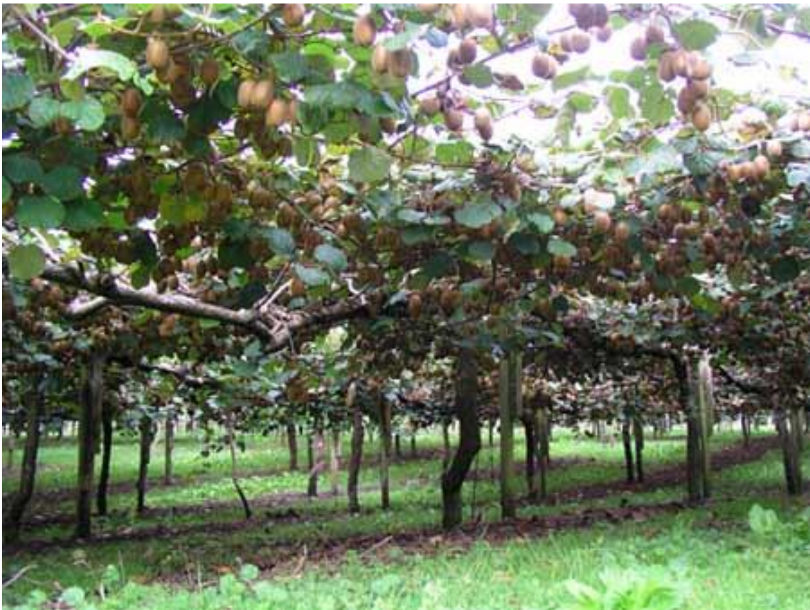
Te Ara ( https://teara.govt.nz/en/photograph/3706/kiwifruit-orchard-bay-of-plenty )