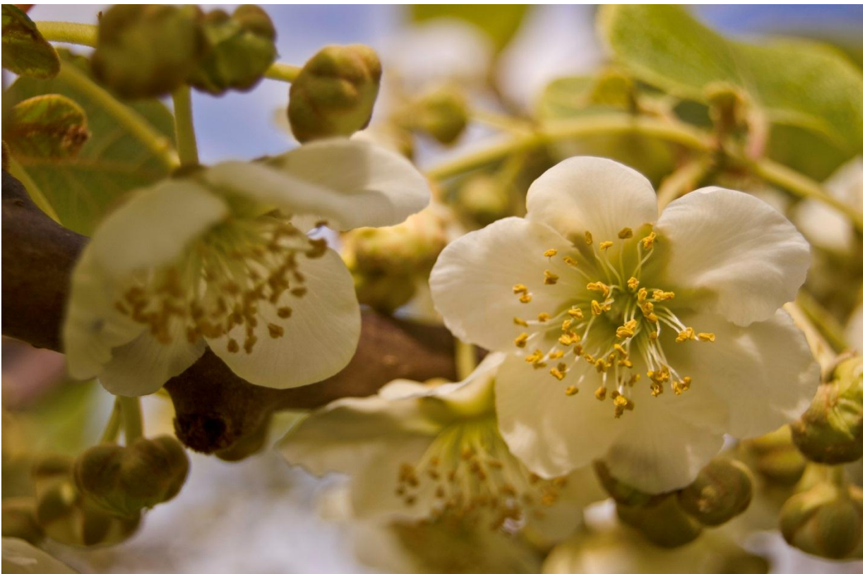
Image 3 Mature male flowers

All these factors highlight the importance of protecting young vines. Adequate shelter, frost protection, nutrition and protective spray coverage should be provided. They also heighten the need to reduce orchard and environmental inoculum levels through timely removal of all Psa-V infected plant material from the orchard.