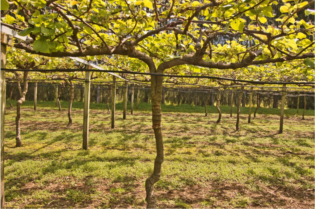
Image 2 Male vine just after bud break