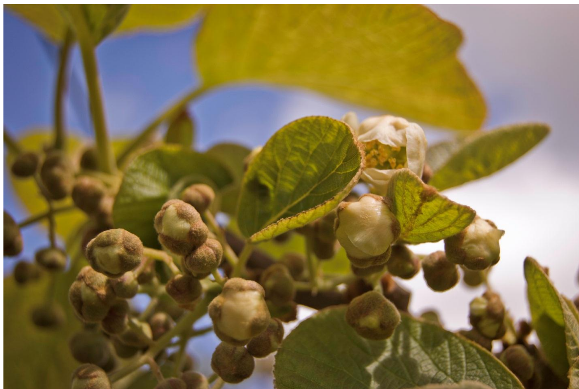
Image 1 Developing male flowers

All three approaches are able to provide some indication of the susceptibility of the different male pollinisers to Psa-V. However they do not guarantee the ability of any cultivar to survive Psa-V in all climates and conditions over the long term.