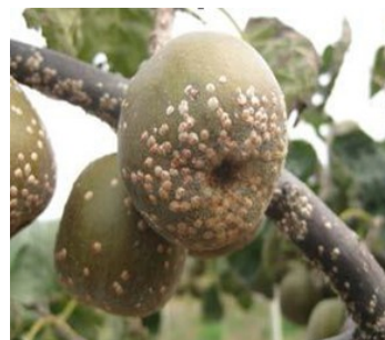
Images above, from left: adult females and larvae; numerous larvae; heavy infestation on 'Hongyang' kiwifruit in China