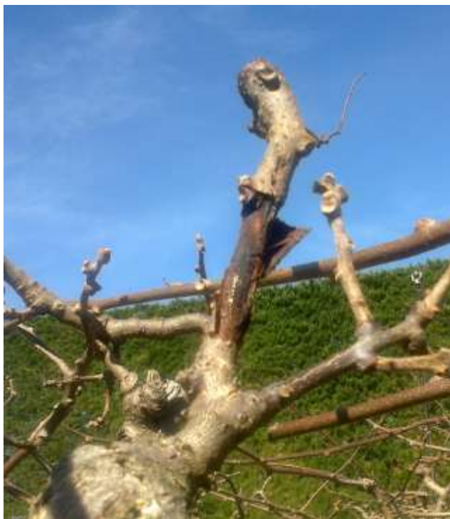
Figure 7: Cane infection - chieftan male