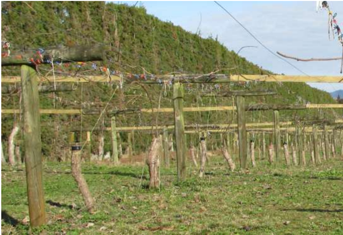
Figure 10: Hayward block transitioning to Gold3 over two seasons.

Observations: Many of the 2013 grafted plants had cane die-back or canes were dis-coloured indicating the presence of infection. Leaders on a high proportion of the plants, and also some trunks, were exudating and in need significant cut-back to remove infection. It is expected some of these scions will require removal and re-graft.