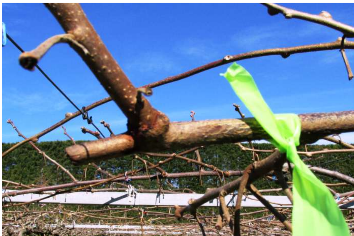
Figure 9: Exudate on Hayward.