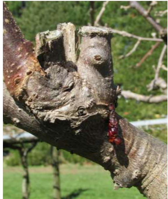
Figure 4: Exudate - chieftan male