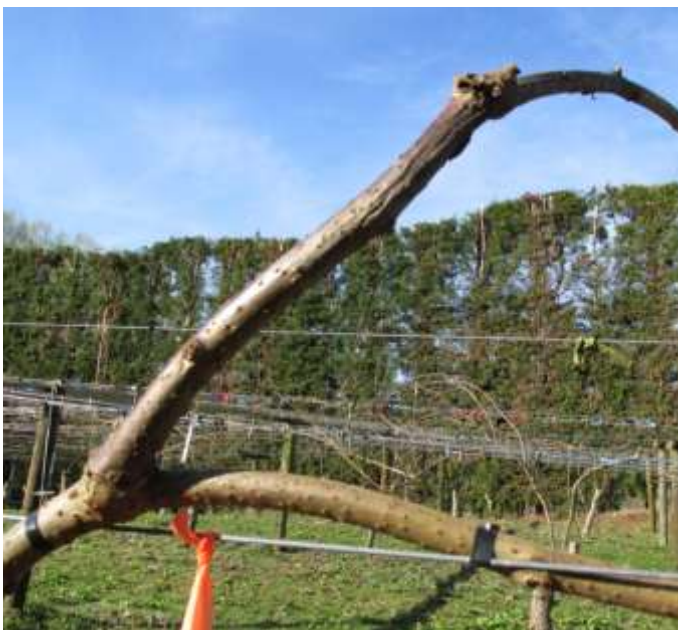
Figure 11: Dehydrated canes off Gold3 leader.