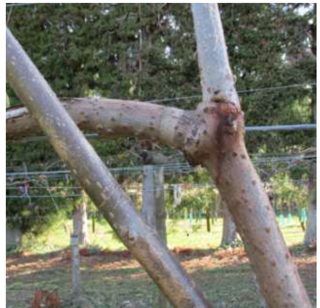
Figure 12: Red exudate at cane joint - 2013 grafted Gold3