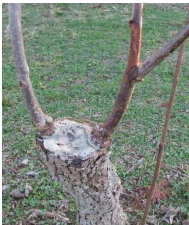
Figure 15: 2013 grafted Gold3 showing recent exudate