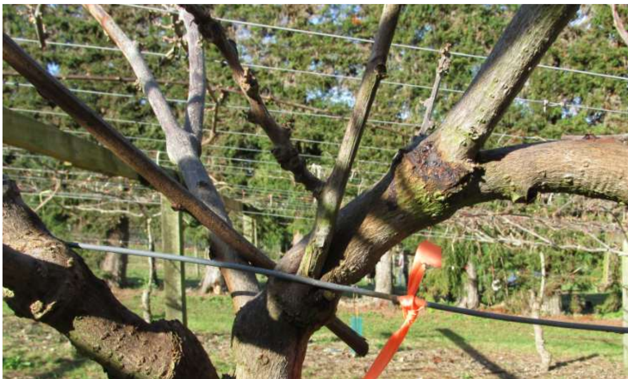
Figure 2: Red exudate - Gold9 trunks.