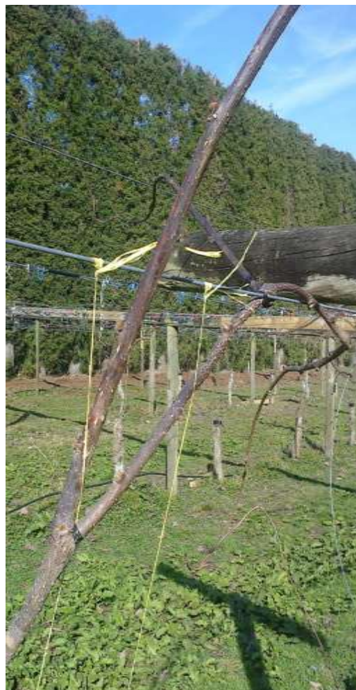
Figure 14: Discoloured and infected Gold3 trunk.