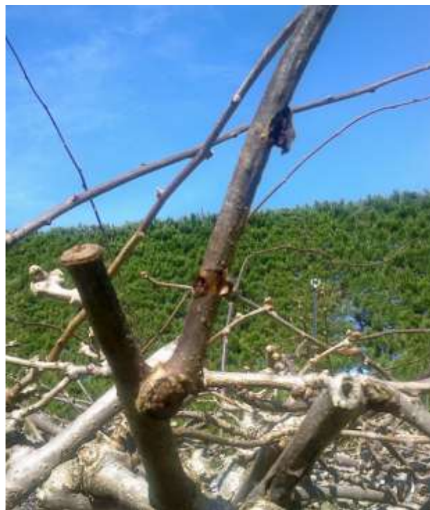
Figure 8: Bud and cane infection -late growth -chieftan male