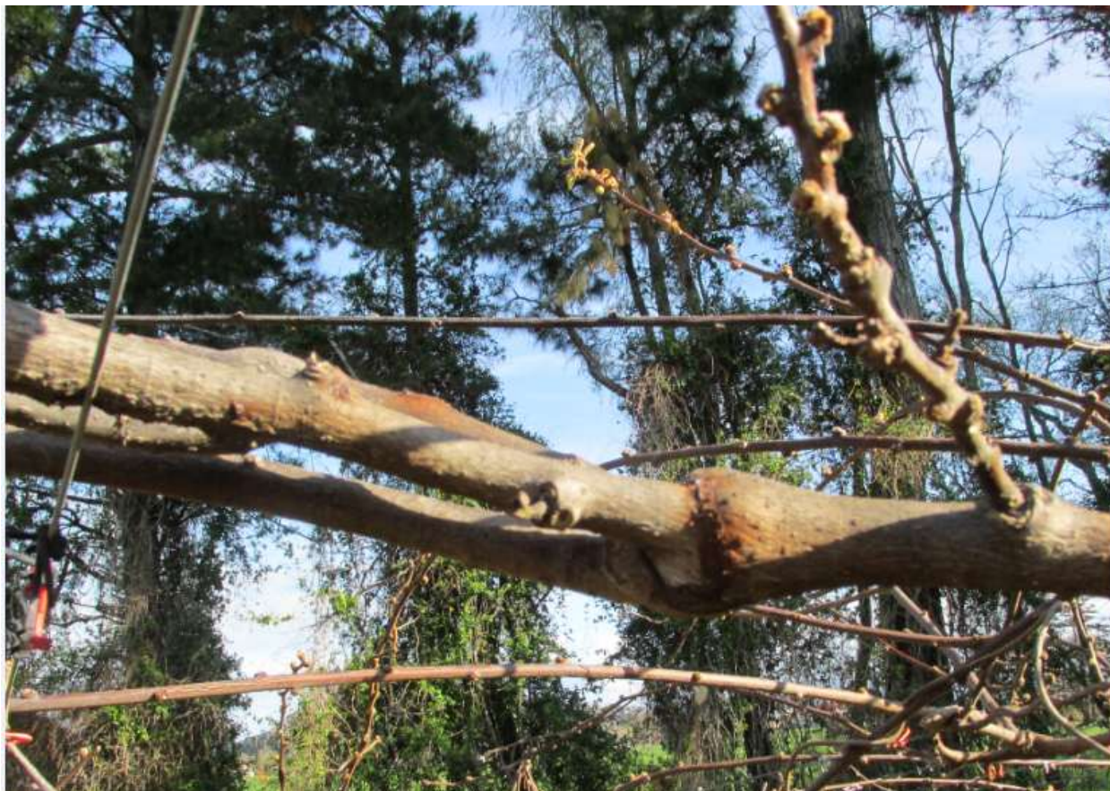
Figure 1: Red exudate - Gold9 leaders.

Observations: Exudate was observed on trunks, leaders and canes and dieback was seen in a number of canes