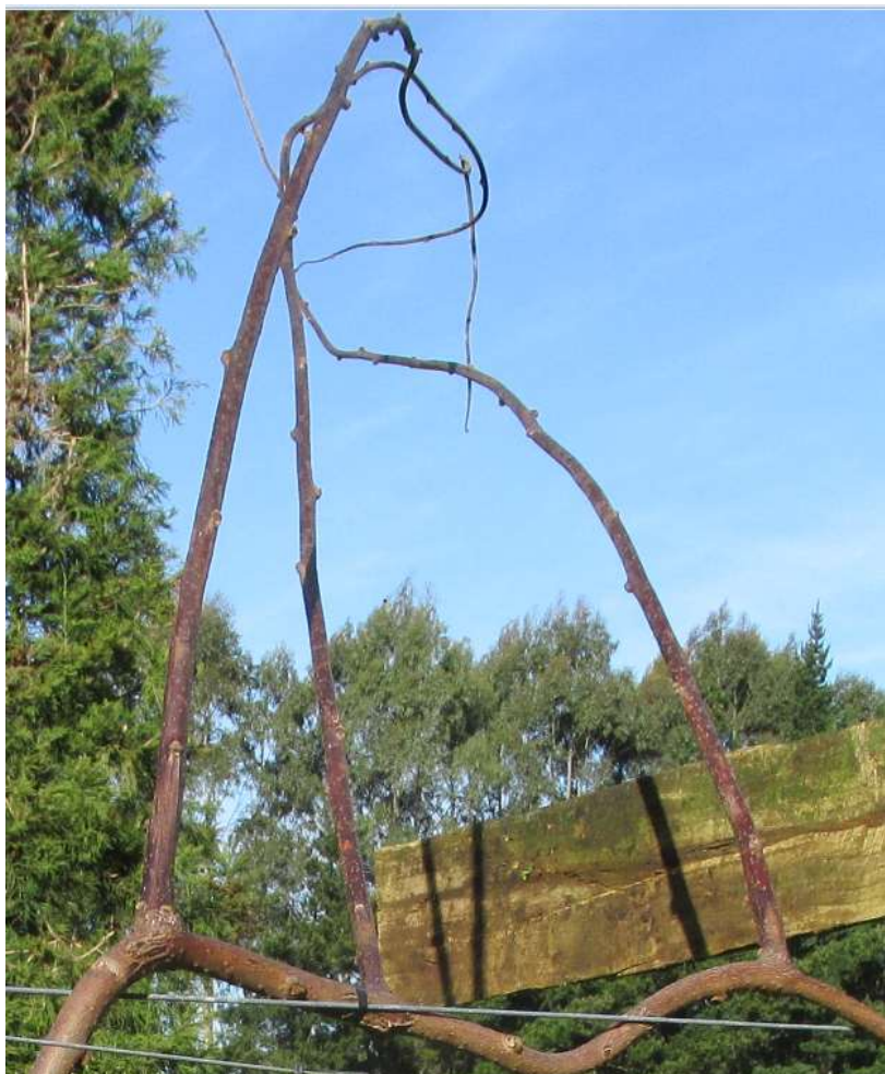
Figure 13: Discoloured and infected canes - 2013 grafted Gold3