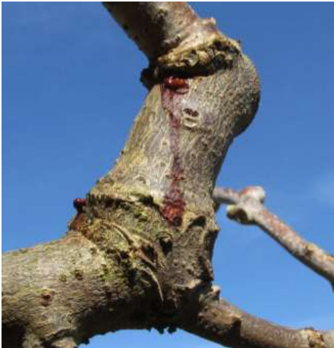
Figure 3: Exudate - chieftan male

For females – Occasionally end buds on canes showed red exudate and some red exudate was seen on cane joints within the canopy.