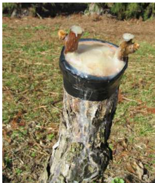
Figure 16: 2014 grafted Gold3 within the conversion block.