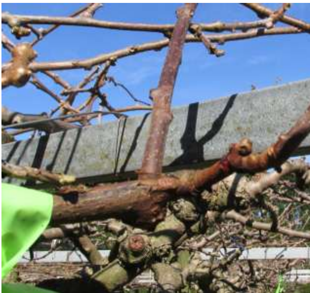
Figure 5: Cane exudate -chieftan male